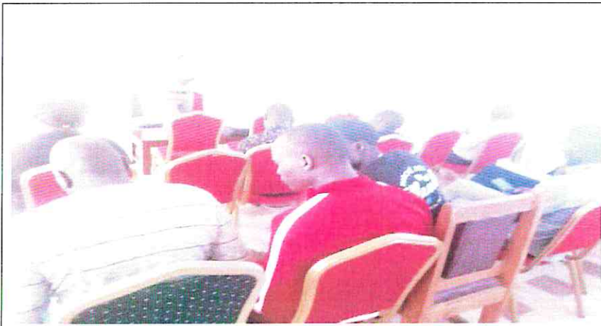
Session at the boardroom