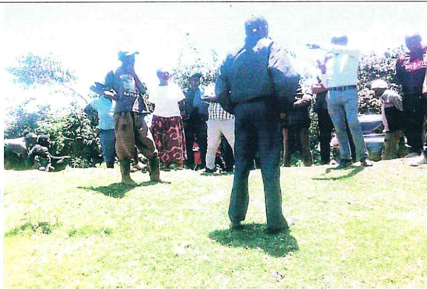
Session at the dam site